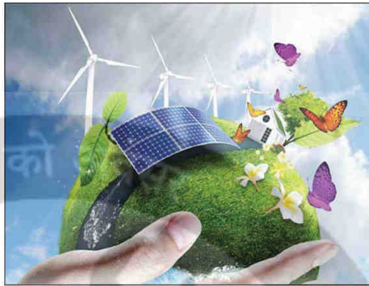
National Energy Conservation Day 14th December

Green energy is derived from natural sources such as sunlight, wind, rain, tides, plants, algae and geo-thermal heat. These energy resources are environment friendly and reduce our carbon footprint. Green energy, however, utilises energy sources that are readily available all over the world, including in rural and remote areas that don't otherwise have access to electricity. Advances in renewable energy technologies have lowered the cost of solar panels, wind turbines and other sources of green energy, placing the ability to produce electricity in the hands of the people rather than those of oil, gas, coal and utility companies. About 30 percent of the world's electricity comes from renewables, including hydropower, solar and wind among others. Costa Rica has produced a whopping 98% of its